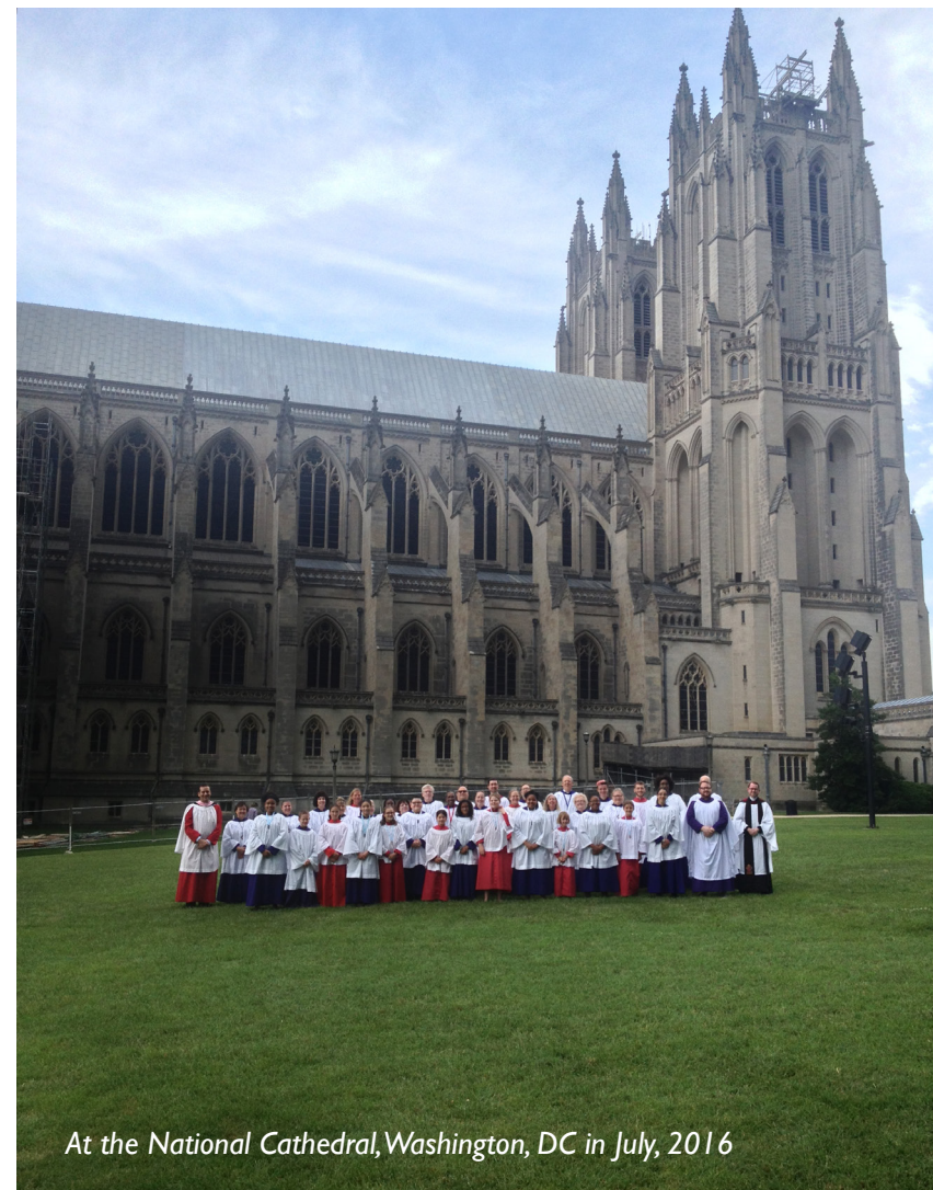
At the National Cathedral, Washington, DC in July, 2016

Partnering institutions are beautiful, child-safe, inspiring places.